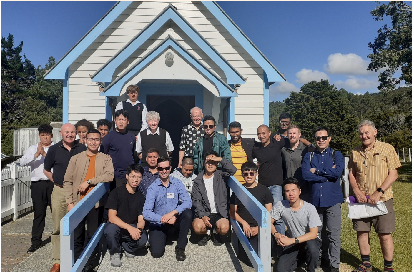
Te Kupenga Staff, Holy Cross Seminary Staff and Seminarians outside St Mary's church at Motuti. The place of the reinterment of the first Catholic Bishop of Aotearoa New Zealand, Jean Baptiste François Pompallier (1802-1871). A place of pilgrimage, visited by many each year, both national and international visitors.